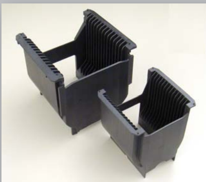
Thin Wafer Bi-Pitch Cassettes